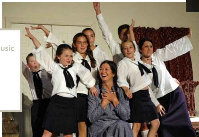
The Sound of Music